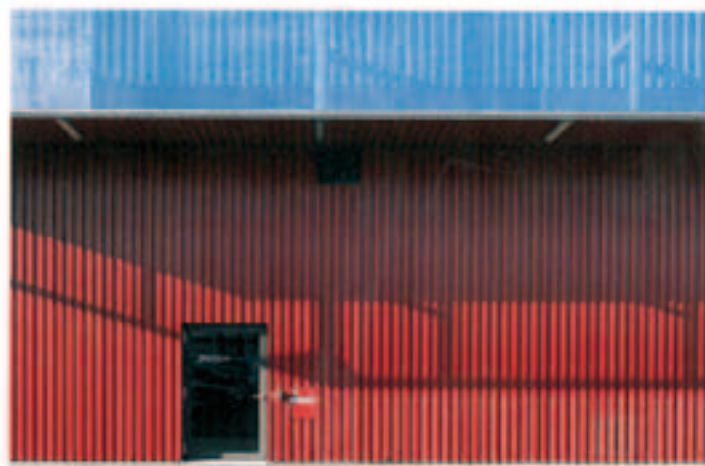
↑ Detail façade with entrance → Entrance area with window towards washing station