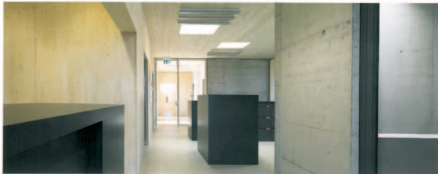
↑ Interior view reception area